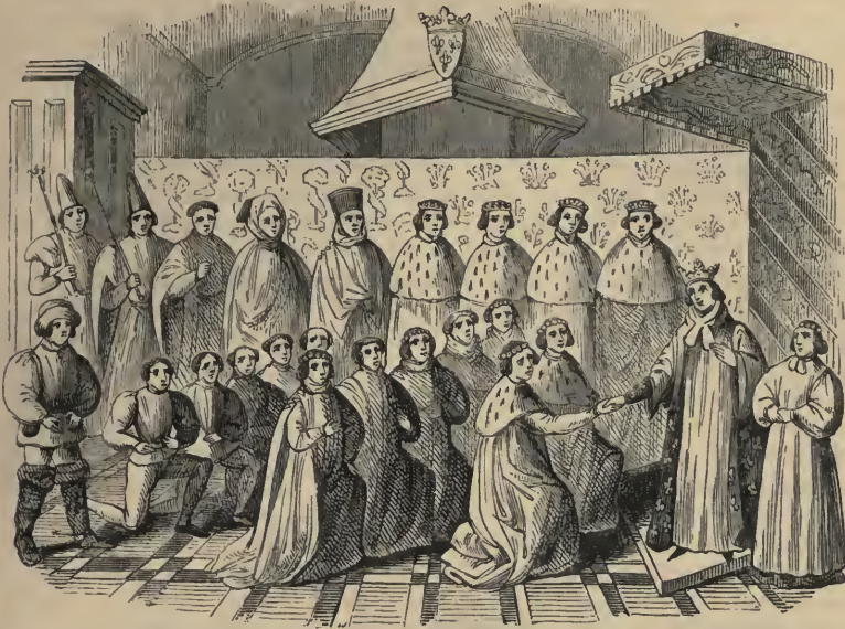
ASSEMBLY OF THE FRENCH KING AND THE LORDS OF FRANCE AND ENGLAND, TO TREAT OF A PEACE BETWEEN THE TWO KINGDOMS. From a MS. Froissart of the Fifteenth Century.

paying each other mutual honours, to the palace of the bishop, where the king and the duke of Touraine were. Having dismounted, they ascended the steps; and the dukes of Berry and Burgundy, taking the English dukes by their hands, led them towards the king of France, the other lords following.